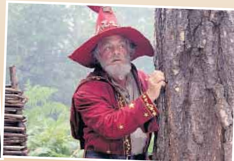
A TOUCH OF MAGIC . . . Sir David as wizard Rincewind in Terry Pratchett's The Colour Of Magic